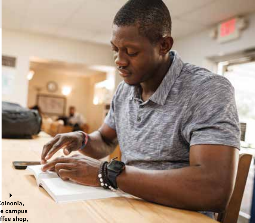
► Koinonia, the campus coffee shop, is a good place to study.

To meet this growing need, Rio Grande has explored offering master's degrees in the past, finding each time that we lacked critical components--namely scholarly resources from our